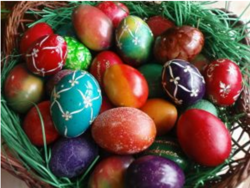
Traditional coloured Easter eggs