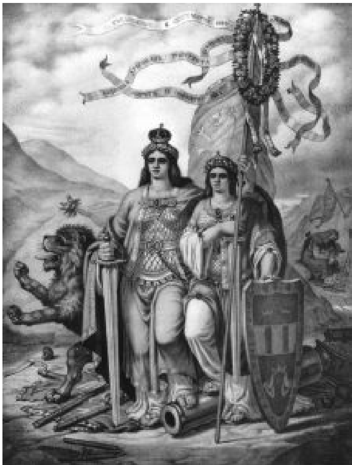
„United Bulgaria“. A litography by Nikolay Pavlovich. In the background is visible the image of a sad girl, which depicts the fate of Macedonian Bulgarians, who during 1885 still remain within the boundaries of the Ottoman empire.

Independence day - 22 September. On this date during 1908 in Tarnovo, the Bulgarian state denounces its political and financial dependence from the Ottoman empire, imposed by the great European countries with the Berlin treaty thirty years earlier. The Bulgarian prince takes the title “tsar”.