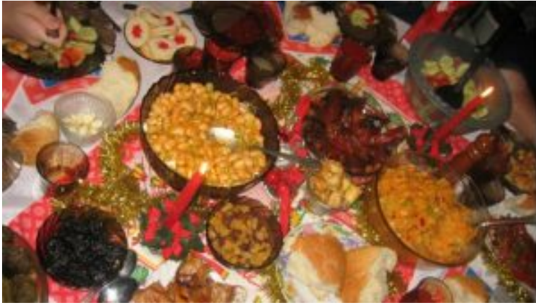
Christmas eve dinner table. Source.

Christmas - 25 and 26 December. One of the greatest Christian holidays. Christians celebrate the birth of the Son of God - Jesus Christ - which, according to Luca, took place in Bethlehem.